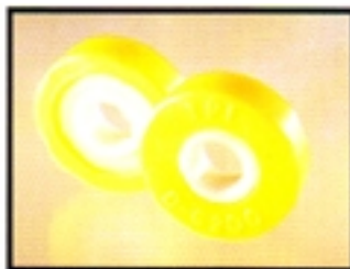
Ball Bearing with Poly Acetyl Outer, Polyoxetal Inner with HCFC Balls