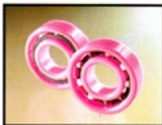
Ball Bearing with Poly Acetyl Outer, Poly Acetyl Inner with Glass Balls