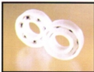
Ball Bearing with Poly Acetyl Outer, Poly Acetyl Inner with Stainless Steel Balls