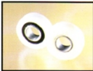
Ball Bearing with Poly Acetyl Outer, IMS Unground Inner & Carbon Balls