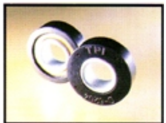
Ball Bearing with Poly Acetyl Outer, Stainless Steel Inner with Stainless Steel Balls