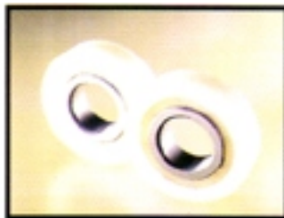
Ball Bearing with Poly Acetyl Outer, En-31/SAE 52100 Grinded Inner with Carbon Balls